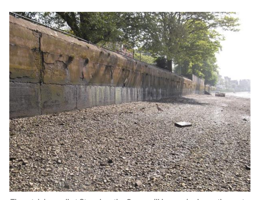
The retaining wall at Strand on the Green will be repaired over the next five months.

"At a time when regeneration is particularly important for this borough, this project fits in well with our improvement works across all of Hounslow."